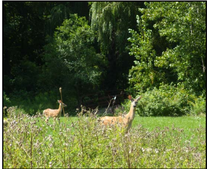
Photo 2. White-tailed deer at CL24.

Mammals common to urban areas are found occasionally with the natural areas system (Photo 2). Such mammals include white-tailed deer, grey squirrel, and raccoon. White-tailed deer are typically more common in larger valleyland systems including the Credit River and Etobicoke Creek corridors in Wards 1 and 2.