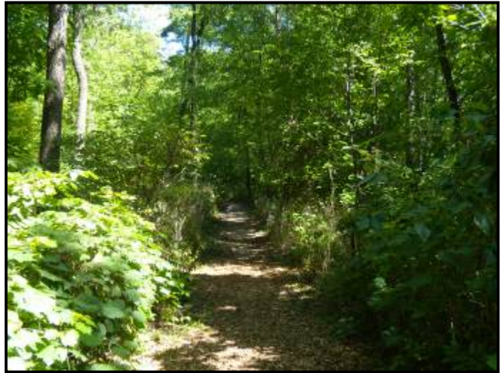
Photo 6. Wood chipped path is fenced on either side to prevent access to natural area at CL39.

In addition, if the natural area occurs in a valleyland, its inherent ability to function as a linkage will promote the spread of these invasive species within the City.