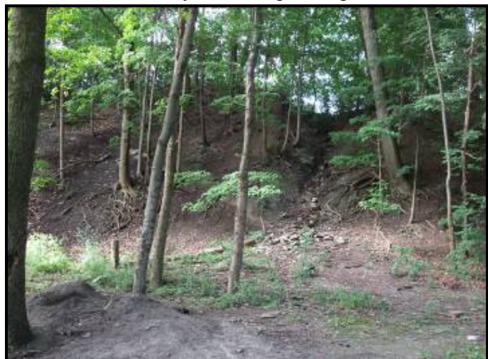
Photo 5. Erosion on forest slopes in ETO8.

It is recommended that these areas be targeted for restoration plantings to discourage or prevent erosion. These areas would benefit from shrub and groundcover plantings such as red-osier dogwood ( Cornus stolonifera ) and ninebark ( Physocarpus opulifolius ) in riparian areas, and Pennsylvania sedge ( Carex pennsylvanica ), heart-leaved aster ( Symphotrichum cordofolium ), and zig-zag goldenrod ( Solidago flexicaulis ) in upland forests.