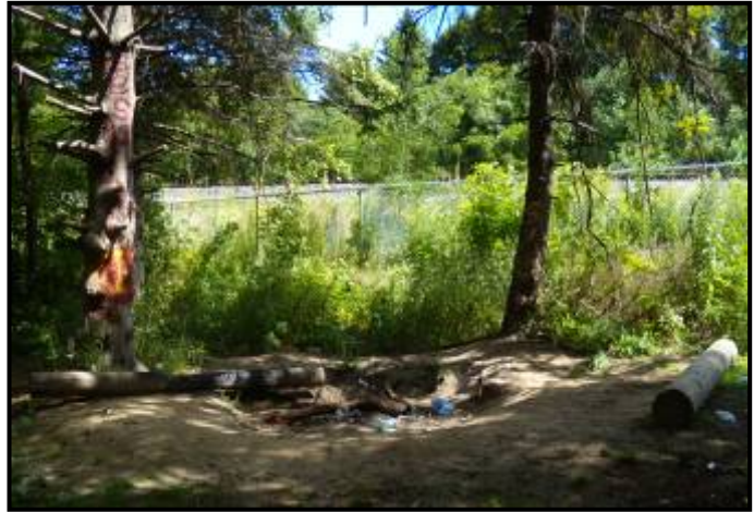
Photo 4. Fire pit, vandalism, and garbage at CL24.

Fire pits were observed within the natural areas system in 2012 (Photo 4). These fire pits are used as party spots. Fires pits within natural areas pose a threat of the potential for forest fires; particularly during a dry summer such as that of summer 2012.