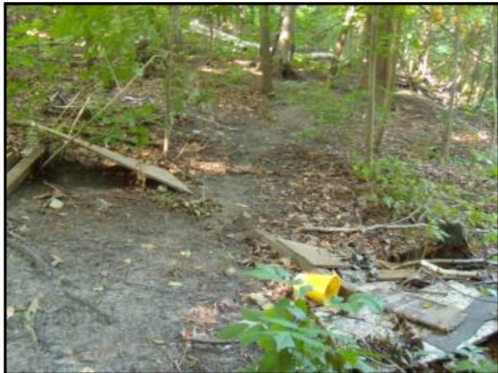
Photo 3. Ad-hoc trail and dumping at CL8.

As noted in previous update studies, the dumping of discarded horticultural plants, largely as a result of encroachment where residents use the natural areas behind their house for compost and dumping yard waste, is another common vector for the introduction of non-native plants to natural areas. In addition to dumping yard waste, garbage and compost often gets dumped into these natural areas as well (Photo 3). Garbage and compost is detrimental to natural areas in that it smothers the ground vegetation and does not allow flora to grow up from underneath. It may also contain potential harmful contaminants, and is a potential hazard for fauna.